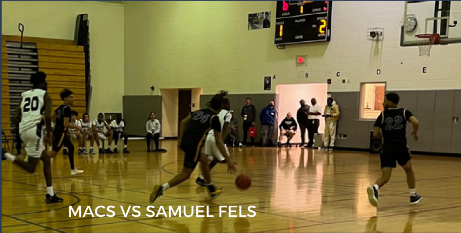
MACS VS SAMUEL FELS