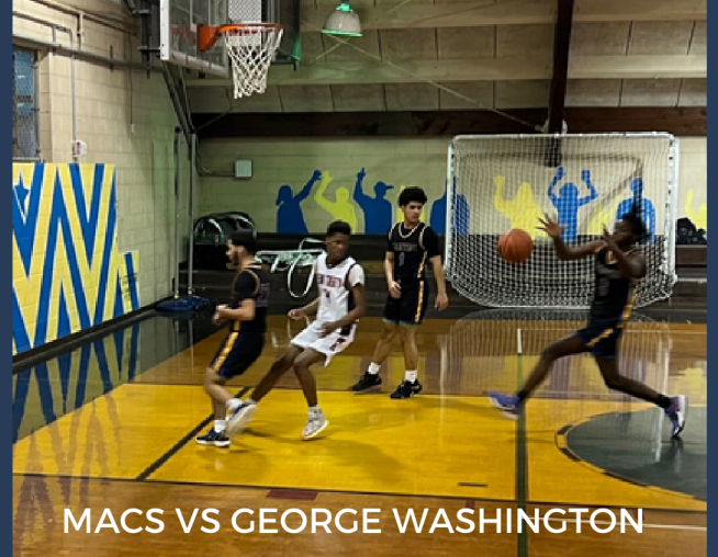
MACS VS GEORGE WASHINGTON