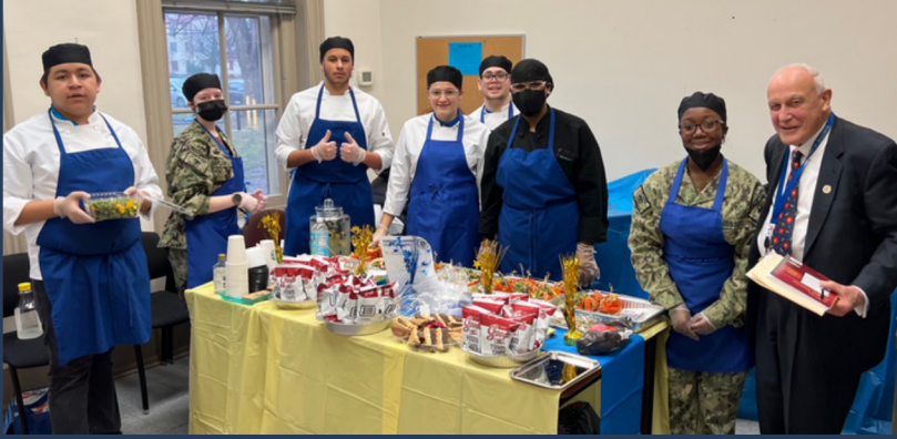
Charter Renewal Visit Breakfast